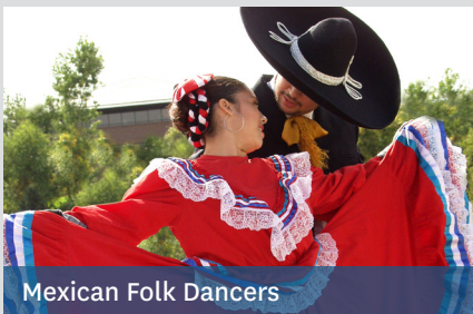
Mexican Folk Dancers