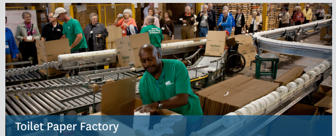
Toilet Paper Factory