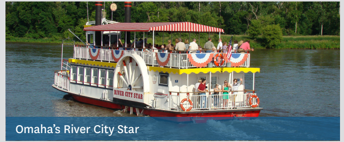
Omaha's River City Star