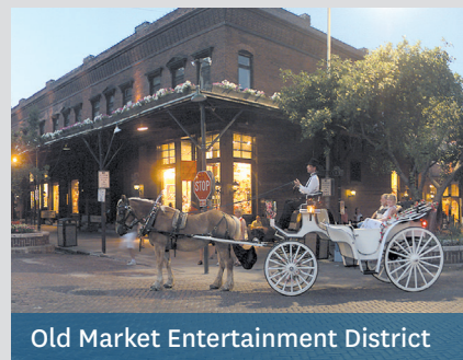
Old Market Entertainment District