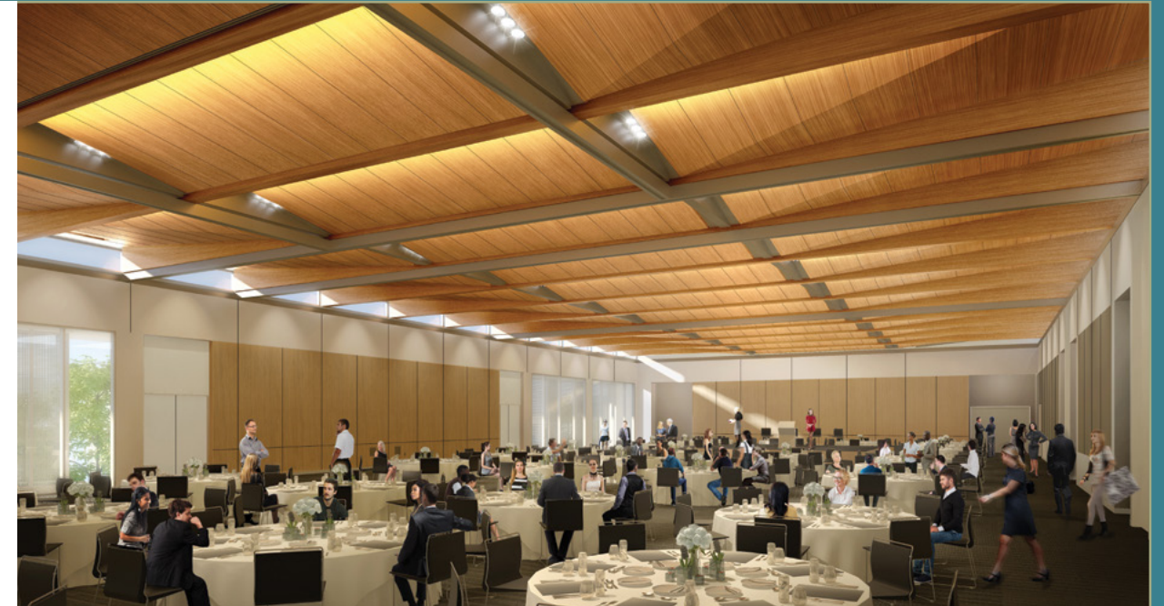
Where inspiration and innovation meet