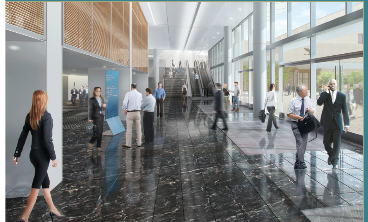
Complimentary basic Wi-Fi

Find out more about the Monterey Conference Connection: MontereyConferenceCenter.com