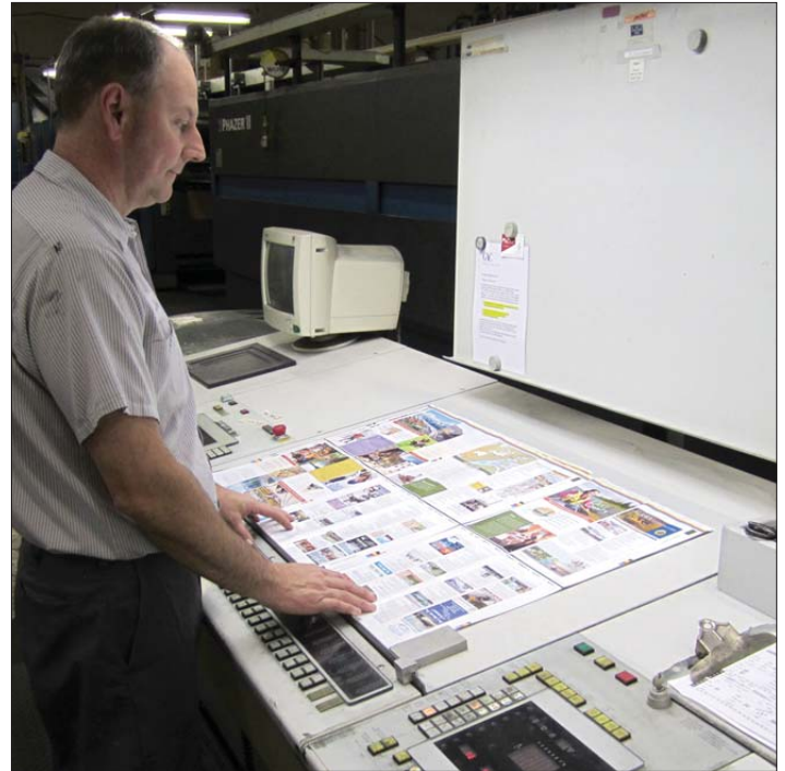
A pressman at the Cenveo publishing house in Portland, Ore., does a press check on the internal pages of the 2011 Mat-Su CVB Visitor Guide in October.