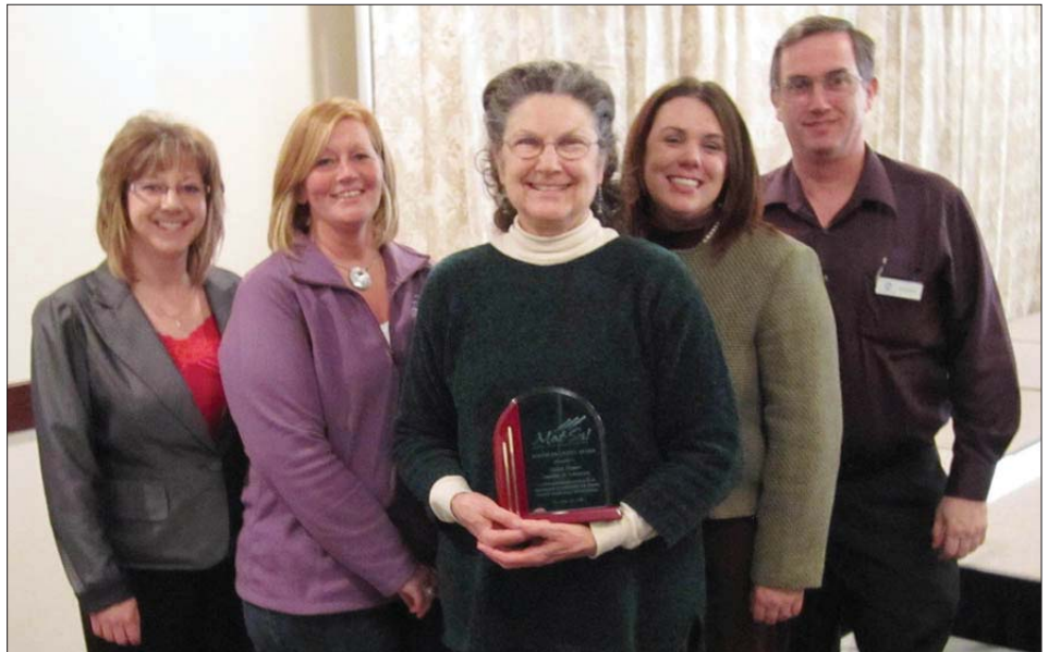
The board of directors from the Greater Palmer Chamber of Commerce accepts the Northern Lights Award at the Mat-Su CVB Stars of the Industry luncheon on Nov. 19.