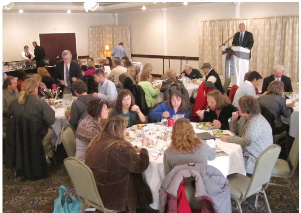
Mat-Su CVB members honored industry leaders at the Nov. 19 Stars of the Industry luncheon at Evangelo's. The luncheon was held in conjunction with the Mat-Su CVB annual meeting and educational seminar.