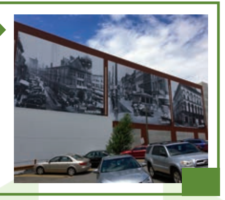
production and installation of the large format historic images that now grace the exterior walls Plaques providing "then and now" information will be installed on the

VK partnered with TN Dept of Tourist Development on a first-of-its-kind promotion - a 3-day concert series streamed live to streets of Chicago. Knoxville closed out the series with Ashley Monroe on stage at the Tennessee Theatre. Stories were reported in SPIN, Rolling Stone and USA Today.