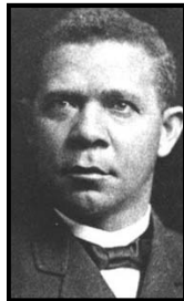
Booker T. Washington

The Gallery includes Black Americans from a wide array of lifestyles and professions, including courageous pioneers, talented artists and entertainers, significant scientist and inventors, prominent civil rights leaders, sports heroes, notable writers, distinguished educators and eminent religious leaders. You will experience history, perhaps as you never have before from the perspective of Black Americans.