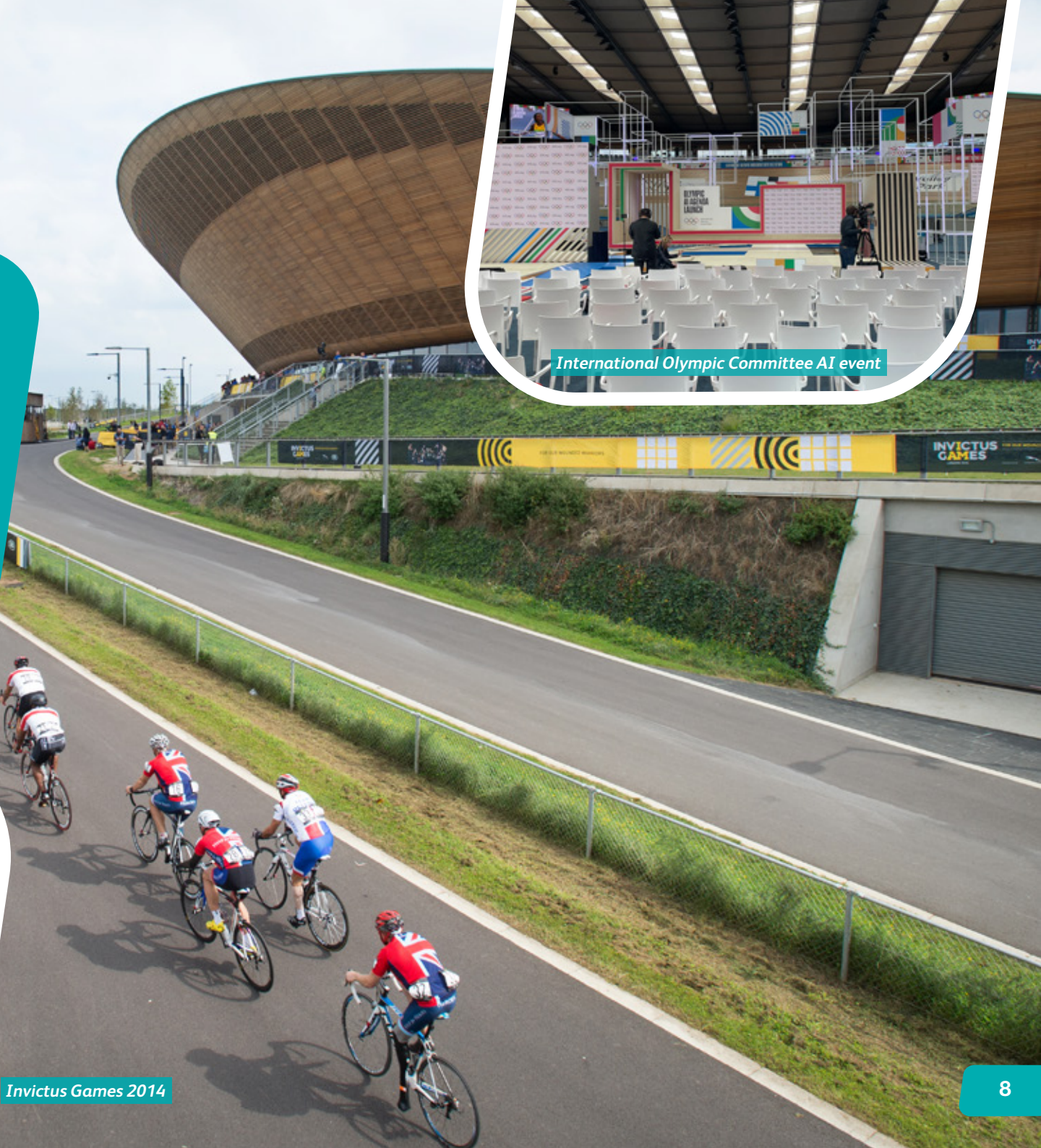
Invictus Games 2014