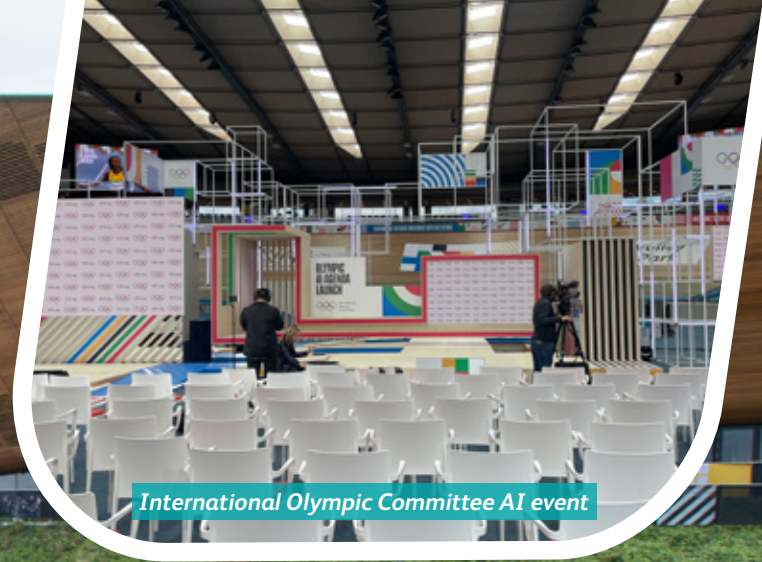
International Olympic Committee AI event

From local competitions to international championships, we've seen exciting events such as British Indoor Rowing Championships, London Youth Games and much more!