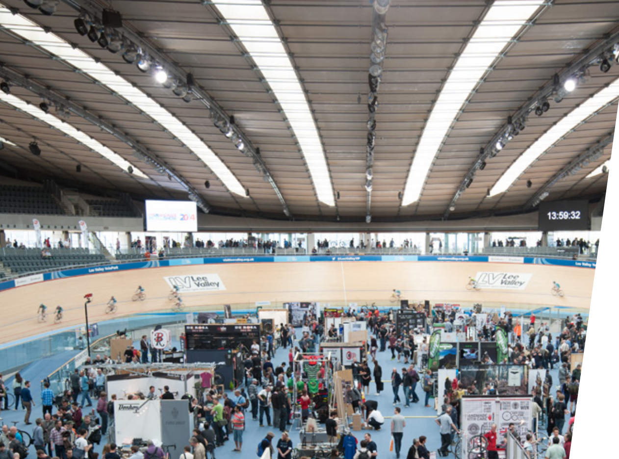
Bespoked Handmade Bike Show 2014

Choose your event setup whether it's on the track, track centre, concourse or all of these. The concourse, which can be divided into 13 pods, is a great space for exhibitors, retailers or food and beverage. It's also an ideal location for private lunches, dinners, meetings or receptions as it offers excellent views of the track.