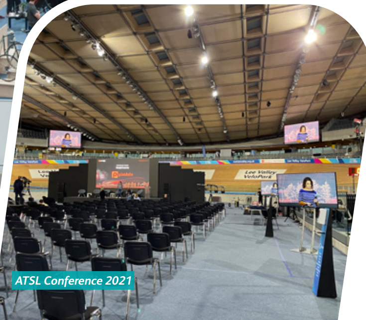
ATSL Conference 2021