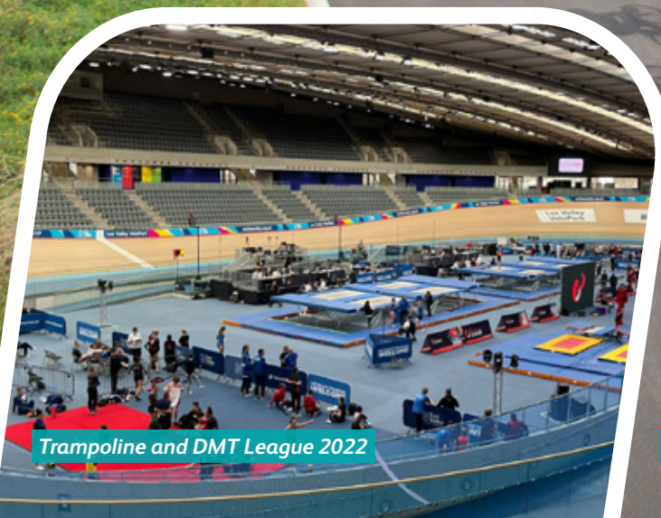
Trampoline and DMT League 2022