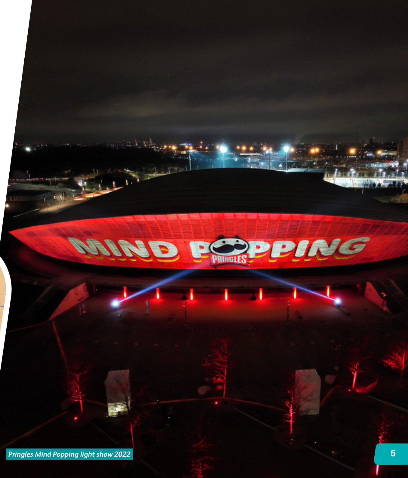
Pringles Mind Popping light show 2022