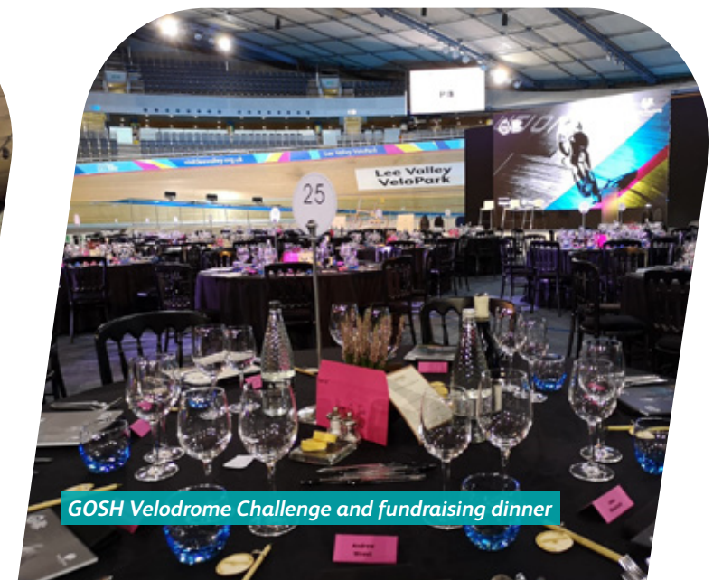
GOSH Velodrome Challenge and fundraising dinner