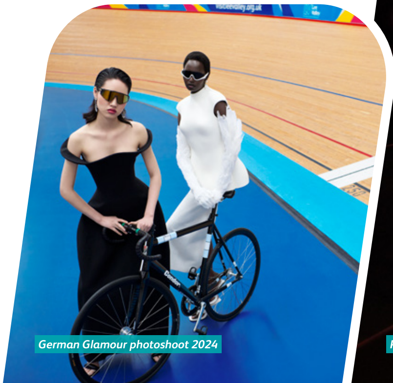
German Glamour photoshoot 2024

From documentaries and commercials to product launches, Lee Valley VeloPark is an iconic location and you might've spotted us on shows such as BBC The One Show, A League of their Own, Black Mirror, Comic Relief, ITV's The Games and Strictly Come Dancing.