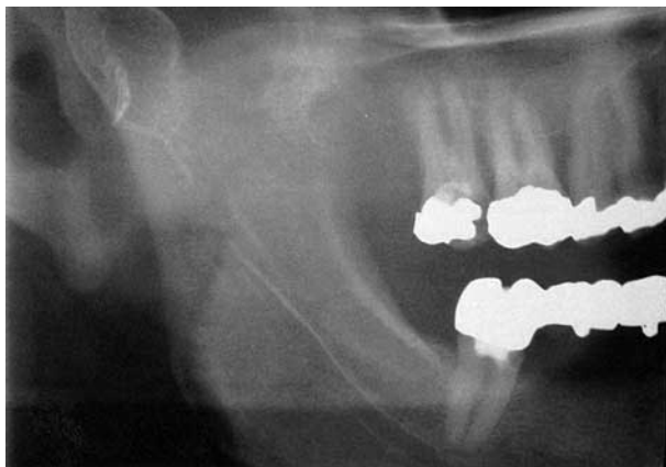
FIGURE 2. Part of a panoramic radiograph showing the radiopaque calcium hydroxide in the inferior alveolar artery.

be an indication of apical perforation. After completion of the instrumentation, the application of an absorbent paper point produced new profuse bleeding from the distal canal. Two mesial canals were dressed with calcium hydroxide paste (Calasept; Nordiska Dental, Ängelholm, Sweden). The bleeding from the distal canal stopped, and calcium hydroxide paste was then applied. When the paste was applied with a syringe in the distal canal, the patient experienced severe local pain. In about 1 or 2 minutes, the corresponding half of the face became pale. During the following 90 minutes, the right half of the face, including the ear, became increasingly cyanotic in combination with increasing pain. Part of the palate, corresponding to the right greater palatine foramen, also became cyanotic. Facial nerve paralysis and trigeminal paresthesia developed in all branches of the right side. Vision in the right eye became blurry. During the progression of symptoms, the patient was admitted to the emergency department of the university hospital, where an ear, nose, and throat specialist, a plastic surgeon, and a maxillofacial surgeon examined the patient. A magnetic