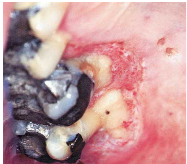
FIGURE 6. A view of the sequestered bone in the right side of the palate.

During the following 3 to 4 months, the patient improved in several locations. The facial paralysis was completely resolved. Permanent loss of mandibular nerve function was obvious by the total absence of activity in the inferior alveolar and mental nerve. The rest of the trigeminal nerve paresthesia was recovered. Paralysis of the lateral pterygoid muscle suddenly disappeared after 3 months, making it