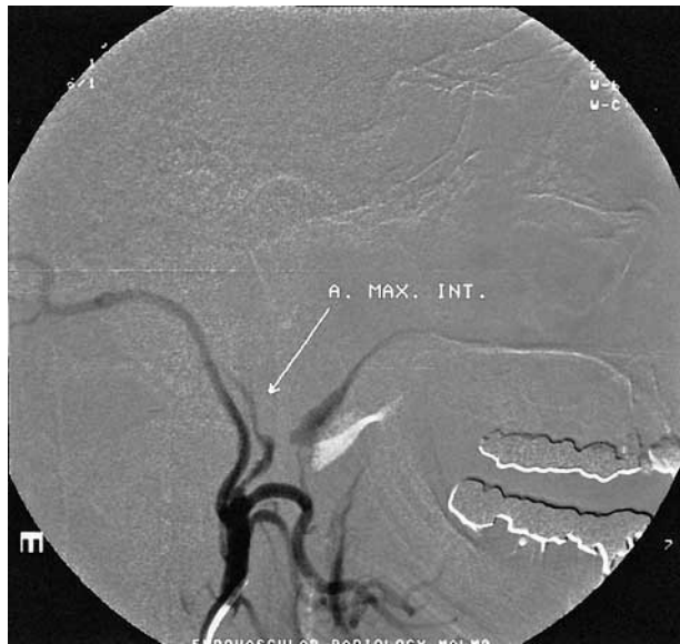
FIGURE 1. Angiogram showing no blood flow in the right maxillary artery.

be an indication of apical perforation. After completion of the instrumentation, the application of an absorbent paper point produced new profuse bleeding from the distal canal. Two mesial canals were dressed with calcium hydroxide paste (Calasept; Nordiska Dental, Ängelholm, Sweden). The bleeding from the distal canal stopped, and calcium hydroxide paste was then applied. When the paste was applied with a syringe in the distal canal, the patient experienced severe local pain. In about 1 or 2 minutes, the corresponding half of the face became pale. During the following 90 minutes, the right half of the face, including the ear, became increasingly cyanotic in combination with increasing pain. Part of the palate, corresponding to the right greater palatine foramen, also became cyanotic. Facial nerve paralysis and trigeminal paresthesia developed in all branches of the right side. Vision in the right eye became blurry. During the progression of symptoms, the patient was admitted to the emergency department of the university hospital, where an ear, nose, and throat specialist, a plastic surgeon, and a maxillofacial surgeon examined the patient. A magnetic