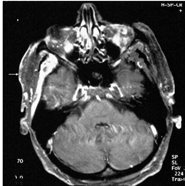
FIGURE 4. Magnetic resonance image showing edema (arrow) in the right temporal muscle demarcated by a hyperemic zone.

resonance imaging examination was started but could not be completed because of claustrophobia.