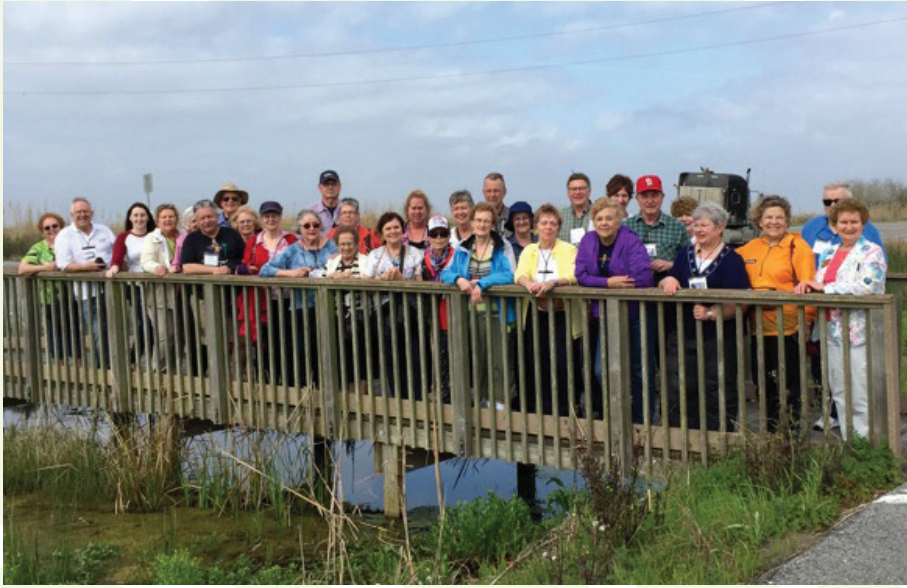
Mayflower Tours enjoyed the Cameron Prairie National Wildlife Refuge and are looking forward to bringing more group tours next year to Southwest Louisiana.

From January through May 2015, Mayflower Tours brought more than 1,000 mid-westerners to visit the Southwest Louisiana area via motor coach as part of their Value Series Tour. These group visitors got to experience many aspects of our destination, including casinos, the Creole Nature Trail All-American Road, the Charpentier Historic District, and the Mardi Gras Museum of Imperial Calcasieu (complete with King Cake tastings!). Attendees also got their fill of our scrumptious Cajun and Creole cuisine at a number of local restaurants. This tour has been so well received by Mayflower's clients that a New Orleans/Lake Charles/Memphis tour will be added to Mayflower Tours' regular programming in 2016!