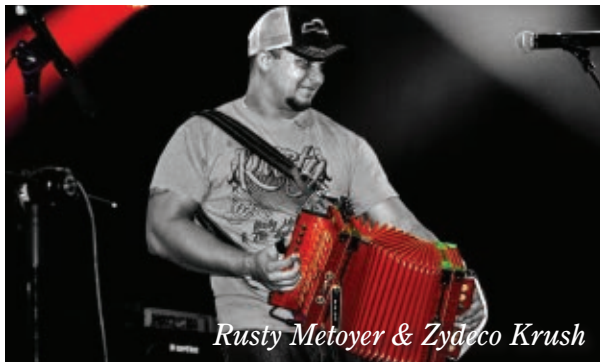
Rusty Metoyer & Zydeco Krush